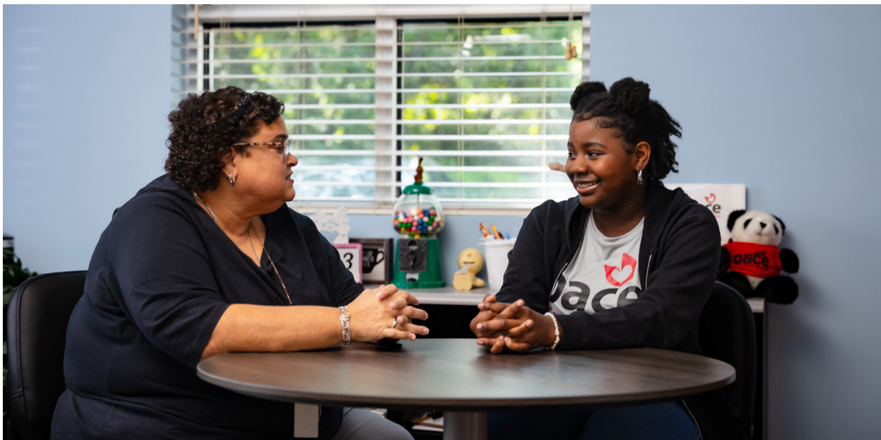
Pace Center Jacksonville, FL, counselor meeting with a Pace girl.

In a similar vein, all Pace girls have access to counselors whenever needed, and team members receive formal training to create a shared language and approach to assessing situations and opportunities to address girls’ emotional needs. To illustrate, a training like the “ 7 Habits of Highly Effective People ” provides a common language for assessing one’s self-efficacy and for reflecting on personal and professional situations. In addition, every team member at Pace has access to emotional support at no cost through Modern Health , a platform that provides live therapy and group sessions.