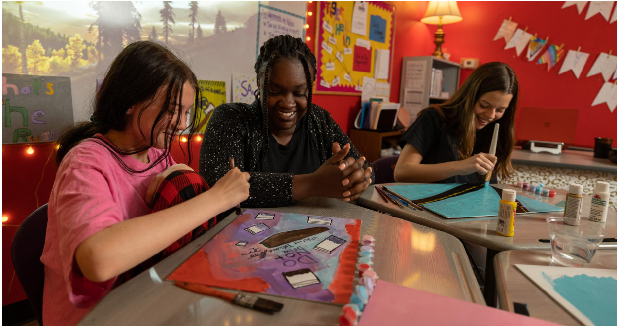
Pace Center Pinellas, FL, experiential learning session.

Where can other leaders begin? The first question to answer is whether your school system has enough informed leadership capacity, like Lyles's, to devote to culture building or could benefit from inviting a culture-building ally like EL Education or Communities in Schools to work alongside. The second question is whether you have access to content and delivery mechanisms to promote culture-building ideas to influence the way adults and students interact. In other words, are you best off building or borrowing expertise?