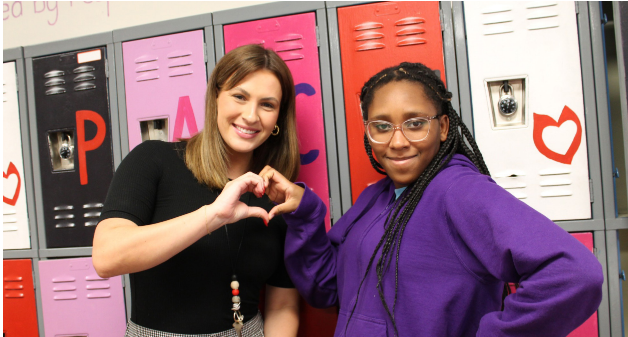
Teacher and student bonding at Pace Center Pasco, FL.

But belonging doesn't come out of nowhere. In successful schools or organizations, belonging is built atop those other critical outcomes. Building teachers' competence, autonomy, and shared purpose within a school community fosters a sense of belonging. Retention fails when, in the absence of sufficient and relevant professional development, mentoring, classroom resources, and well-being and leadership support, teachers feel less competent, less trusted to make decisions in their classrooms, and less confident that they share goals and aims with school peers and leaders. School environments where teachers struggle to find a sense of belonging are the most likely to be losing teachers early.