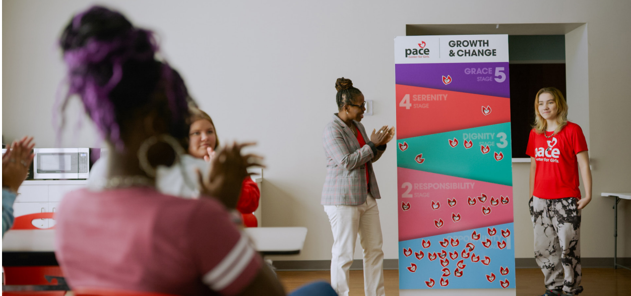
Pace Center Clay, FL, Growth & Change Ceremony, with hearts for each girl participant.