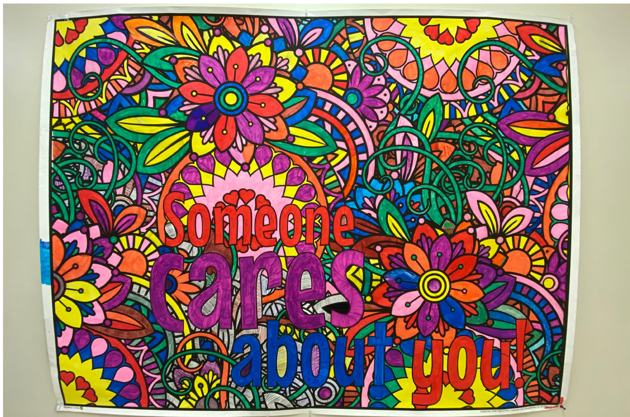
“Calm down” coloring mandala at Pace Center for Girls, Broward County, FL.