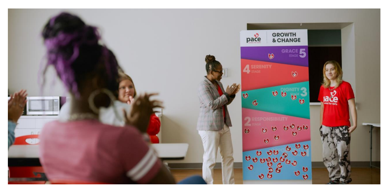
Pace Center Clay, FL, Growth & Change Ceremony, with hearts for each girl participant.