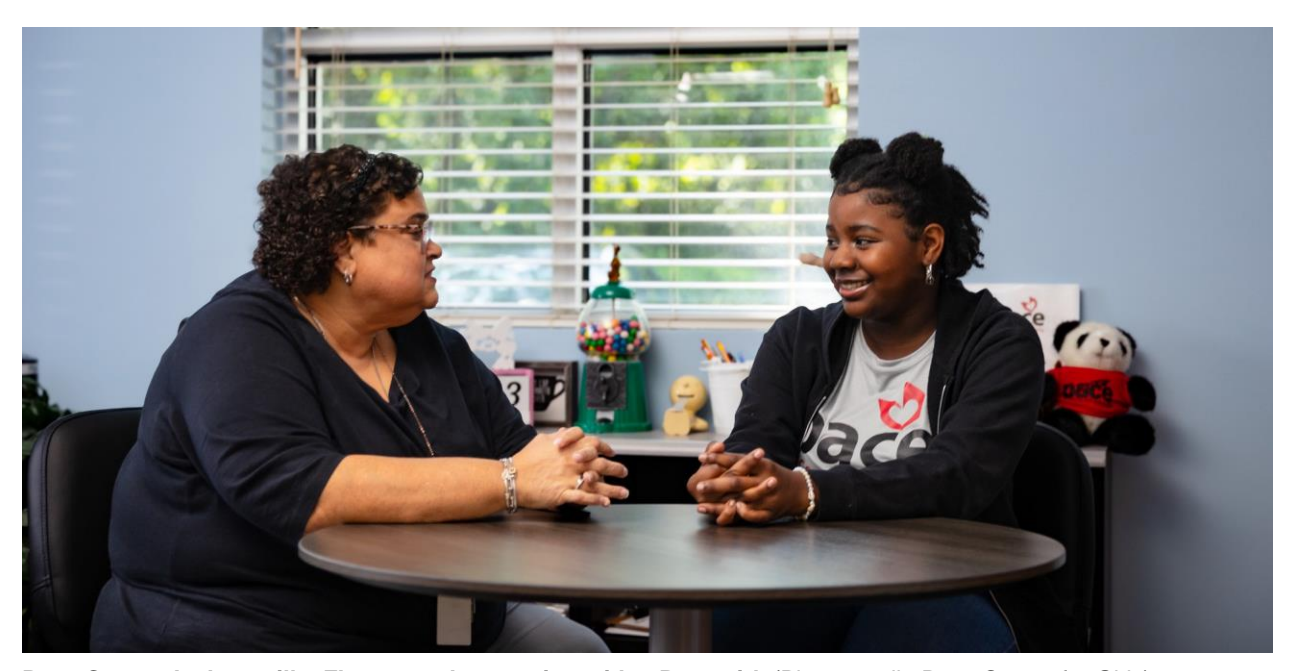
Pace Center Jacksonville, FL, counselor meeting with a Pace girl.

In a similar vein, all Pace girls have access to counselors whenever needed, and team members receive formal training to create a shared language and approach to assessing situations and opportunities to address girls' emotional needs. To illustrate, a training like the "7 Habits of Highly Effective People" provides a common language for assessing one's self-efficacy and for reflecting on personal and professional situations. In addition, every team member at Pace has access to emotional support at no cost through Modern Health, a platform that provides live therapy and group sessions.