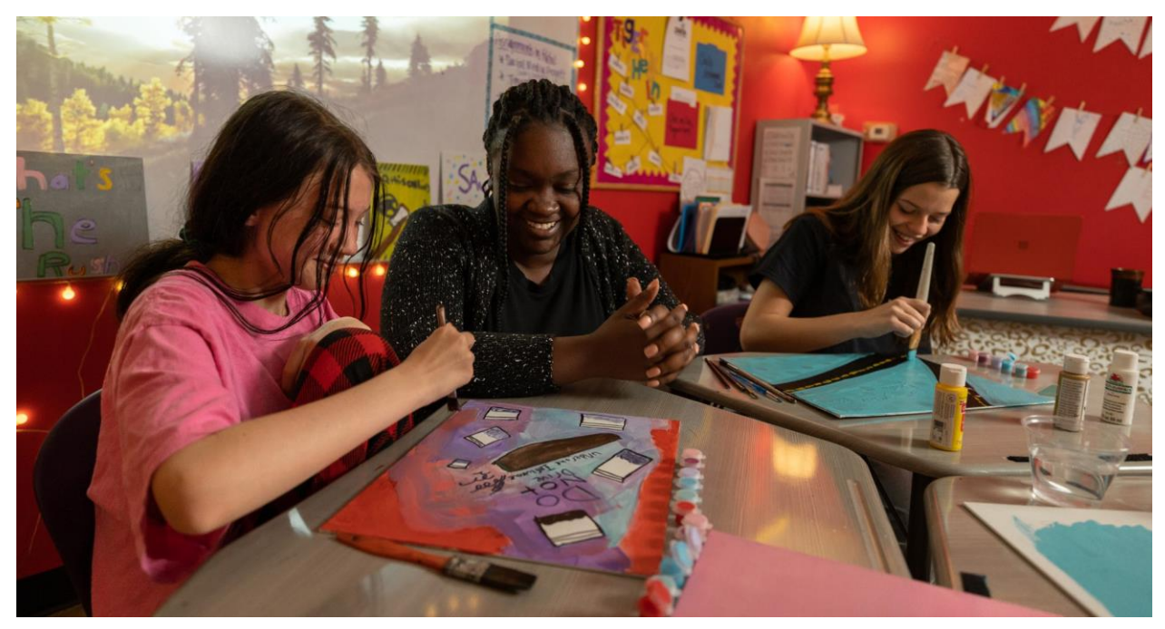
Pace Center Pinellas, FL, experiential learning session.

Where can other leaders begin? The first question to answer is whether your school system has enough informed leadership capacity, like Lyles's, to devote to culture building or could benefit from inviting a culture-building ally like EL Education or Communities in Schools to work alongside. The second question is whether you have access to content and delivery mechanisms to promote culture-building ideas to influence the way adults and students interact. In other words, are you best off building or borrowing expertise?